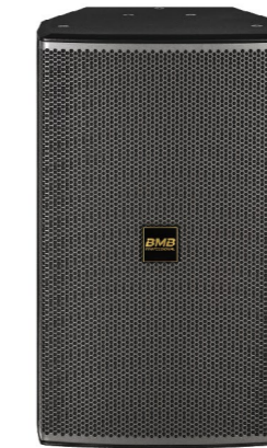
CSS-8012 II [12"]